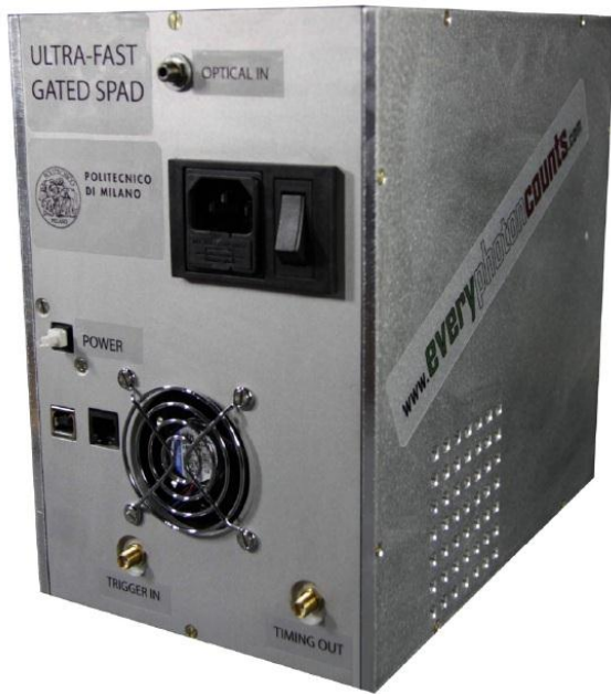
Figure 4.1: Picture of the fast-gated module designed, assembled and tested for clinical applications.